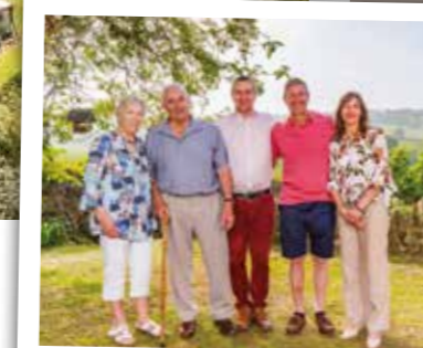
The team at Andrewshayes

A Andrewshayes Holiday Park is located in an Area of Outstanding Natural Beauty in east Devon and is a medium-sized, family-orientated park. Customers return year after year to enjoy the relaxed and friendly atmosphere of the site, its free to use pool, bar and restaurant.